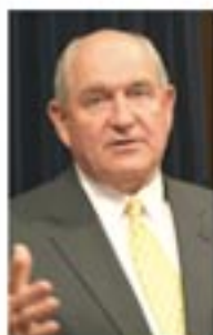
Gov. Sonny Perdue

"Georgia has reached an important milestone in our fight against Cancer."